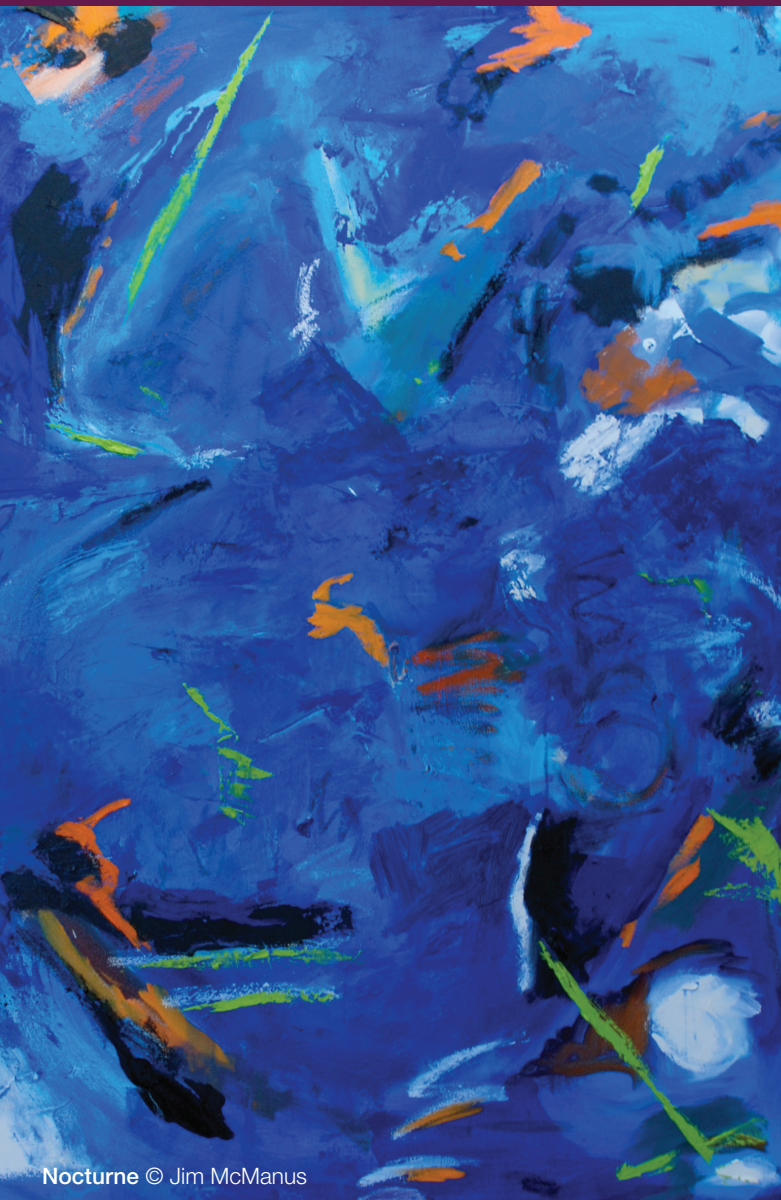
Nocturne © Jim McManus

“When we are working in complex situations with diverse others, collaboration cannot and need not be controlled.”